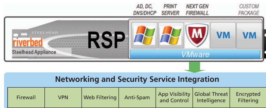
Figure 1. Multilayer security in a single RSP package.

Today, the weakest link in network security is the application layer. Our firewall, trusted by organizations with some of the most secure environments worldwide, provides broad application discovery and control. McAfee Firewall Enterprise protects