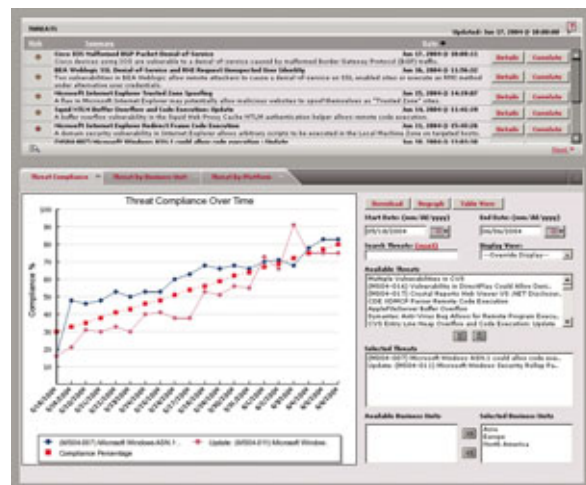
Threat Compliance View enables organizations to receive up-to-the-minute alerts on breaking threats and measure compliance by threat, business unit, and platform.