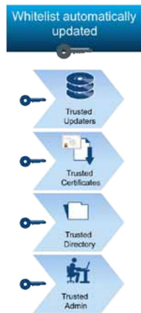
Figure 2. Secure update flow.

McAfee Application Control software includes a suggestions interface that recommends new update policies based on execution patterns at the endpoints. It's an excellent way to manage exceptions generated by blocked applications. Simply inspect the exceptions and the details of the blocked application. Then, either approve and whitelist the file or ignore it when the application is meant to be blocked.