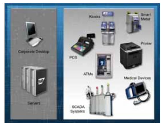
Figure 1. In addition to desktops and servers, McAfee Application Control software extends protection to fixed-function devices to significantly reduce consumer risk.

McAfee® ePolicy Orchestrator® (McAfee ePO™) software consolidates and centralizes management, providing a global view of enterprise security—without blind spots. This award-winning platform integrates McAfee Application Control software with McAfee Risk Advisor, McAfee Host Intrusion Prevention, McAfee Firewall, and other McAfee security and risk management products. In addition, McAfee ePO software can easily embrace products from McAfee Security Innovation Alliance Partners, as well as your home-grown management applications.