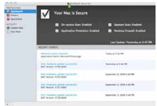
McAfee Endpoint Protection for Mac safeguards your Macs—and closes gaps in your security perimeter

This isn’t your father’s anti-virus. With its advanced anti-malware protection that includes anti-spyware, a robust system firewall, and application protection (as well as anti-virus), McAfee Endpoint Protection for Mac offers complete coverage for the Mac users in your organization.