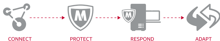
Figure 2. McAfee Threat Intelligence Exchange solution process.

McAfee Threat Intelligence Exchange connects your disparate security components to share contextual insights and deliver adaptive threat protection. Providing an extendable security connected ecosystem that integrates advanced threat analysis with network, gateway, and endpoint solutions, McAfee Threat Intelligence Exchange leverages all available countermeasures to neutralize threats.