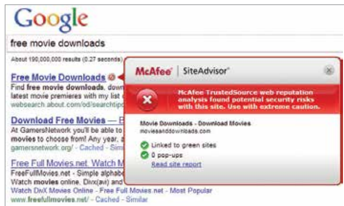
Figure 1. McAfee SiteAdvisor safety rating.

McAfee SiteAdvisor Enterprise solutions provide an intuitive, color-coded safety rating system that provides advanced security warnings.