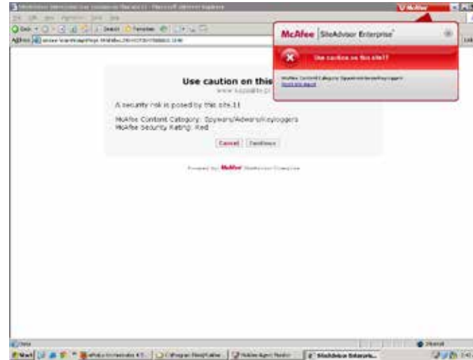
Figure 3. McAfee SiteAdvisor Enterprise blocks access to unwanted websites based on custom blacklists and whitelists.

McAfee Web Filtering for Endpoint is a module enabled in McAfee SiteAdvisor Enterprise, allowing administrators to define a user's browsing environment based on site content categories and create detailed reports on web usage. This ensures that internet usage policy is enforced when a user is both on or off the corporate network.