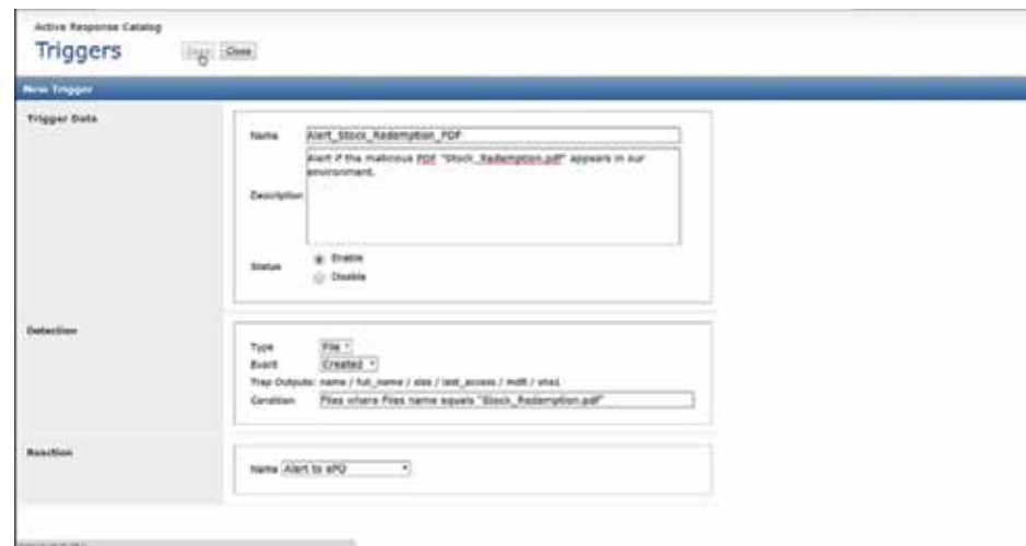
Figure 3. Setting a trigger and specifying a reaction in McAfee Active Response.