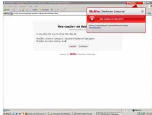
Figure 3. McAfee SiteAdvisor Enterprise blocks access to unwanted websites based on custom blacklists and whitelists.

McAfee Web Filtering for Endpoint is a module enabled in McAfee SiteAdvisor Enterprise allowing administrators to define a user's browsing environment based on site content categories and create detailed reports on web usage. This ensures that Internet usage policy is enforced when a user is both on or off the corporate network.