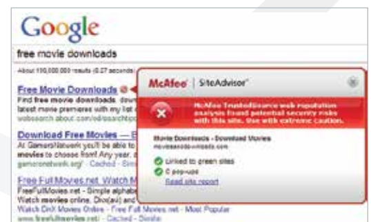
Figure 1. McAfee SiteAdvisor Enterprise solutions provide an intuitive, color-coded safety rating system that provides advanced security warnings.

Innovative McAfee technology automatically monitors the most common online activities, such as using search engines, browsing websites, downloading files, and providing email addresses to sign up for product registrations, services, community access, and newsletters.