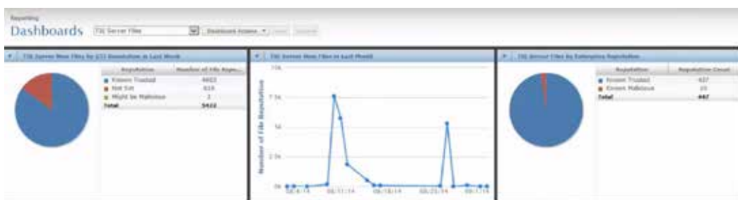
Figure 3. McAfee Threat Intelligence Exchange dashboard.

McAfee Threat Intelligence Exchange works closely with Intel Security's advanced sandbox solution, McAfee Advanced Threat Defense, which feeds malware analysis data to McAfee Threat Intelligence Exchange. If a file is found to be malicious, McAfee Threat Intelligence pushes out a file reputation update to all connected systems over the McAfee Data Exchange Layer. This also works the other way around. When McAfee Threat Intelligence Exchange-enabled endpoints encounter files with unknown reputations, they can be submitted to McAfee Advanced Threat Defense to determine if the object is malicious, eliminating blind spots from out-of-band payload delivery. These two products work together to deliver automated, adaptive protection from emerging threats. Information about discovered attacks is delivered across your environment to help block the cyberattack chain before more damage is done.