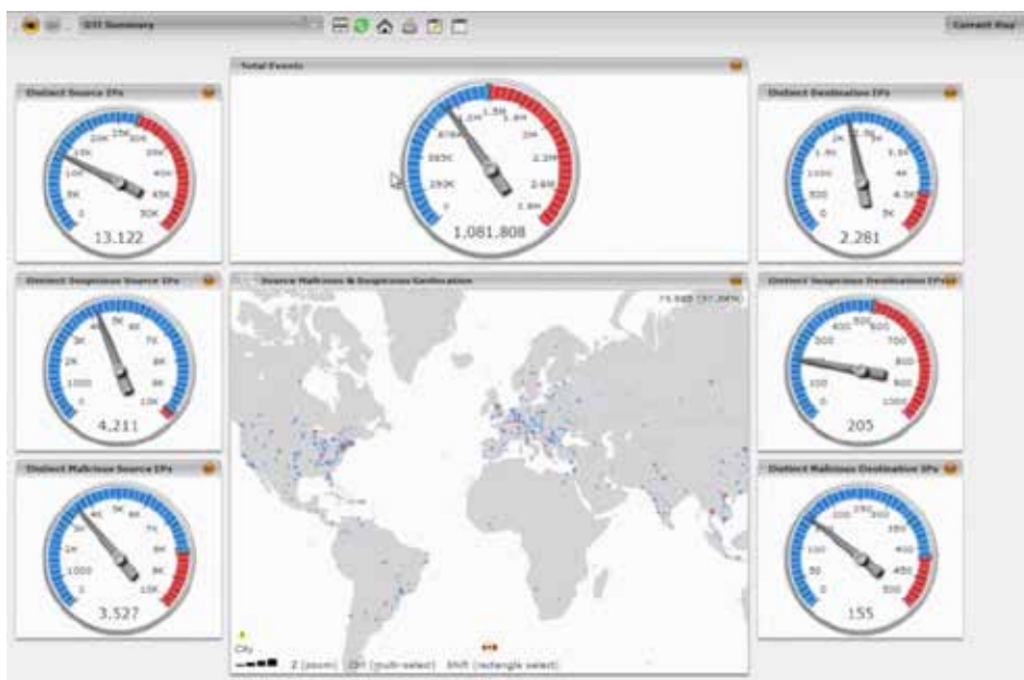
Figure 2. McAfee GTI view.

The Cyber Threat Alliance is a group of security practitioners from organizations that work together to share threat information and help improve defenses against adversaries across member organizations and their customers. Intel Security is among the founding members who have dedicated their resources to determine the most effective ways to share threat data, foster collaboration among members, and make united progress in the fight against sophisticated cybercriminals.