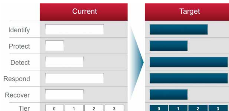
Figure 2. The NIST framework proposes use of a visual profile of an operator's risk management in five core functions. Tiers represent progress toward an “adaptive” level of risk management.

NIST is working in collaboration with the private sector and owners and operators of critical infrastructure to draft a proposed framework. NIST will then spearhead adoption efforts for the cybersecurity framework.