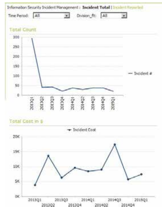
Figure 1. Incident management.

The team uses McAfee Vulnerability Manager to automate scans that go out to all systems, workstations, and servers on a monthly basis for security patching, to keep policy violations in check, and to meet compliance standards. It verifies the Microsoft System Center Configuration Manager (SCCM) environment. CDCR also uses McAfee Vulnerability Manager to scan database servers or a single host, like a website, to check for vulnerabilities.